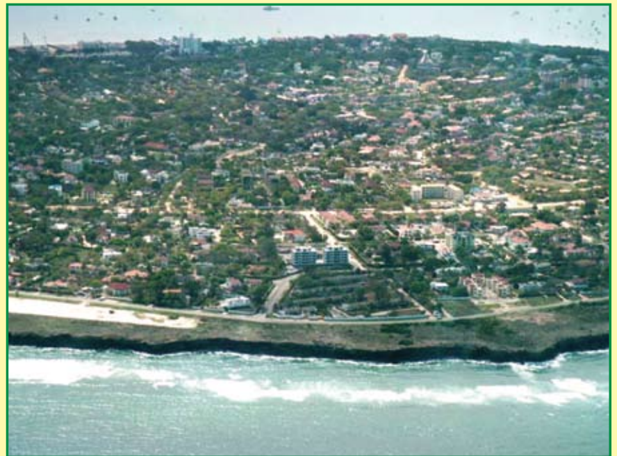
Aerial view of Dar es Salaam city